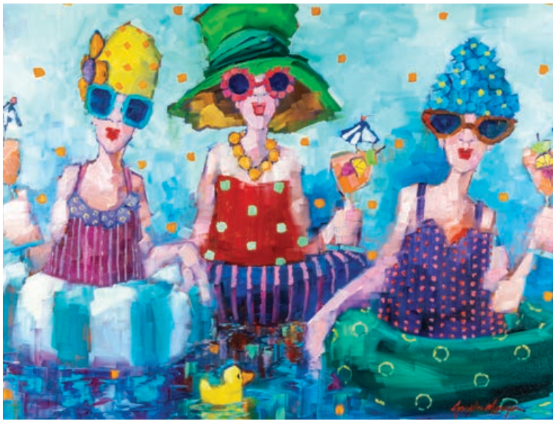
NEW A Vision of Loveliness