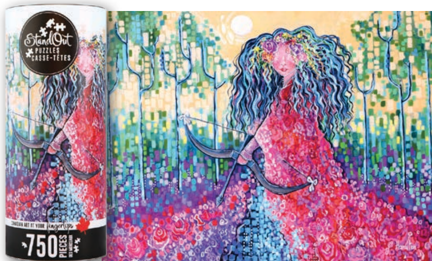
NEW The Huntress