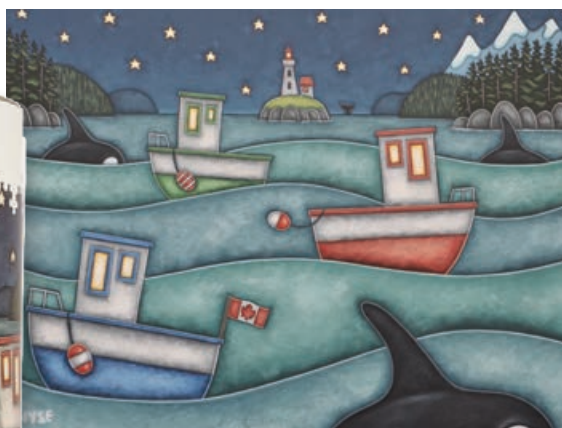
NEW Crossing the Sound