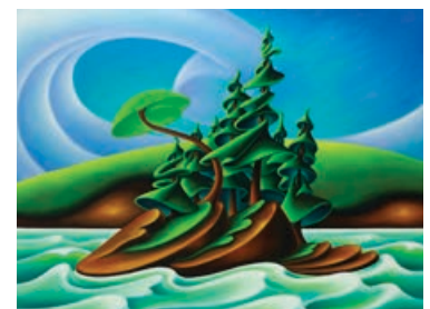
Leaving Mayne Island