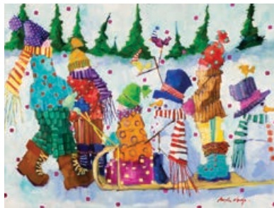
The Jig is Up