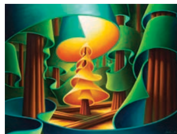
Golden Spruce Illuminated