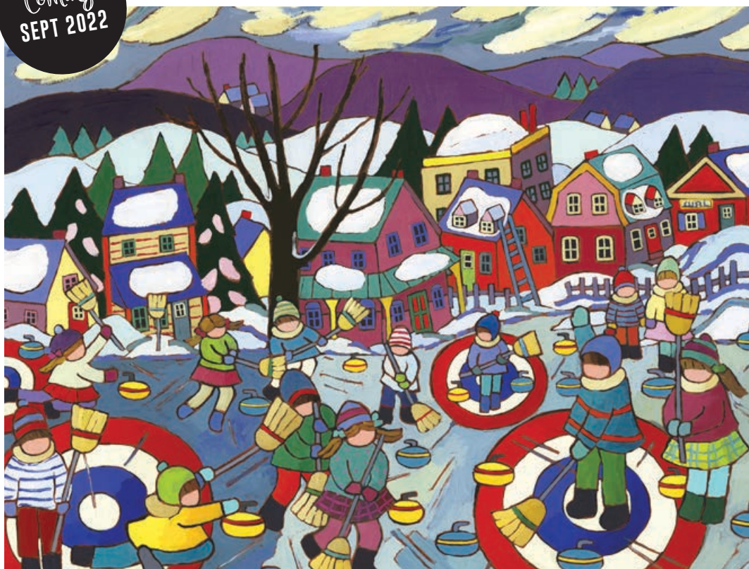
NEW Curling on the Ottawa River