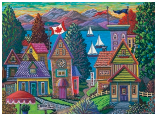
Pathway to the Beach