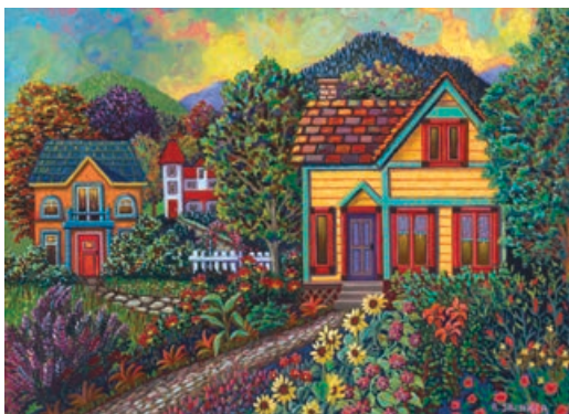
Sweet Days of Summer