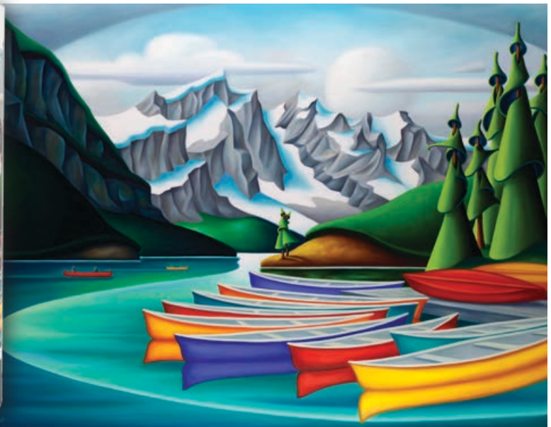
NEW Summer Vacation