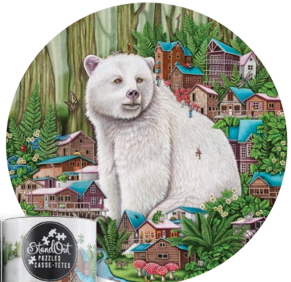
Spirit of the Forest