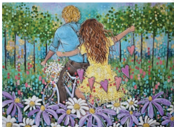
Sunshine on a Saturday