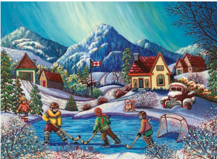
NEW Seize the Moment