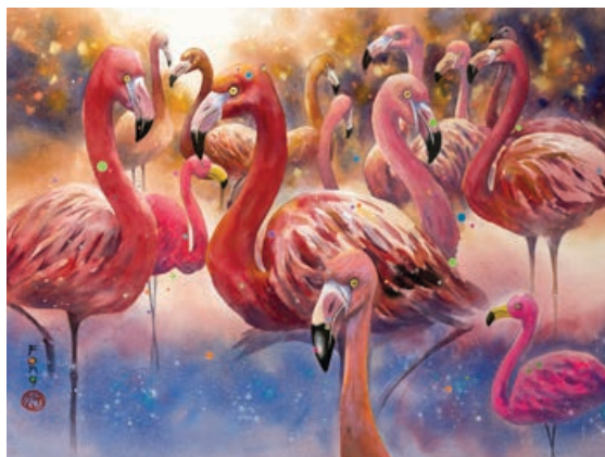
Late to the Party