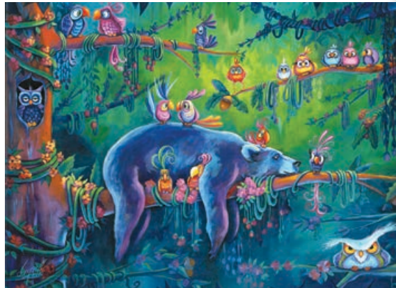
Feeling a Little Blue